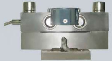
Load cells MK-QS-D